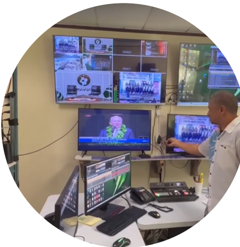
Deputy Laupola reviewing the digital broadcast playout.